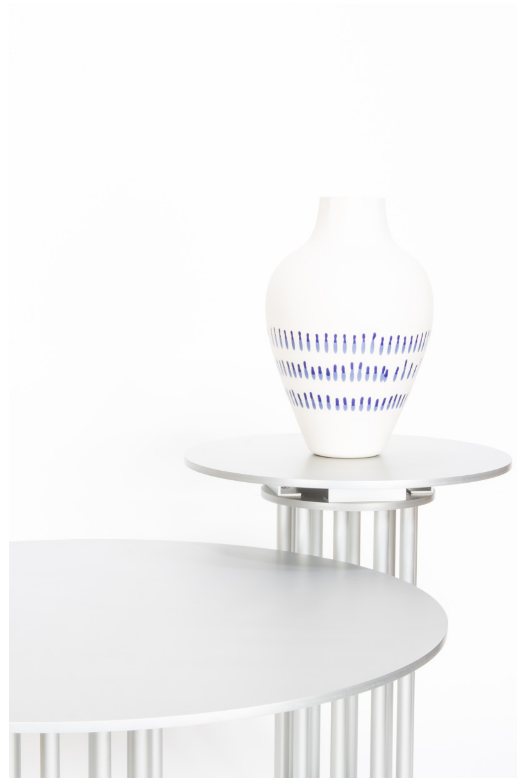
MOCA vase on side table Tholos