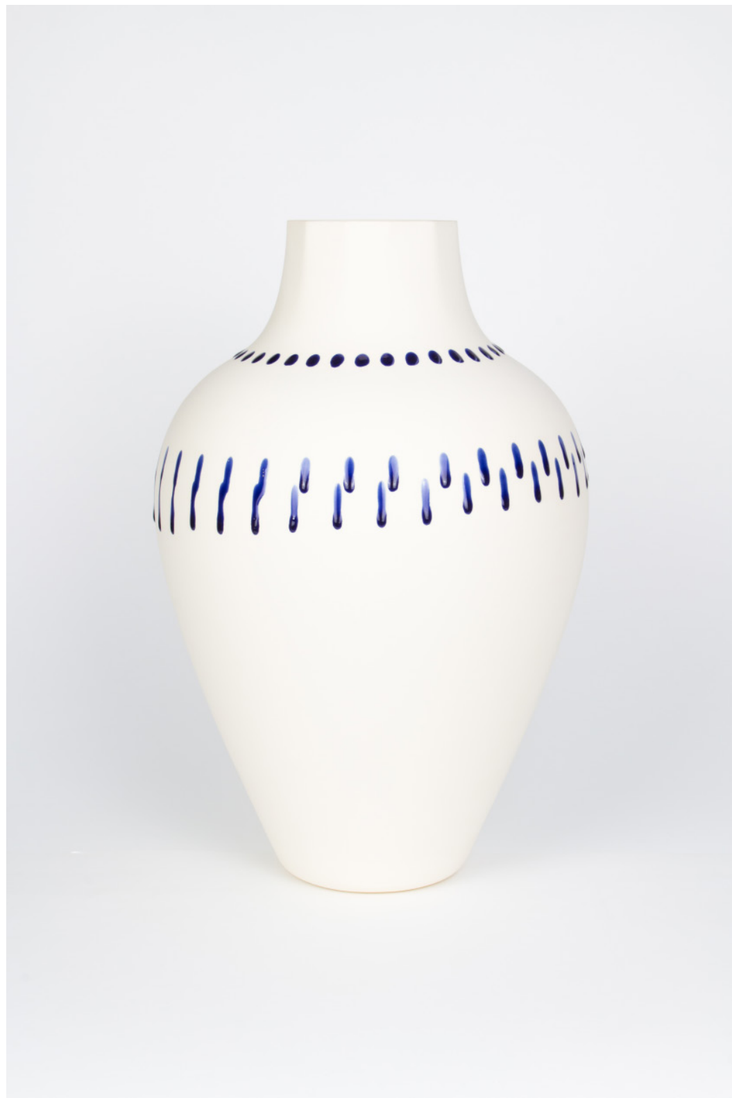
Vase Moca 1/100