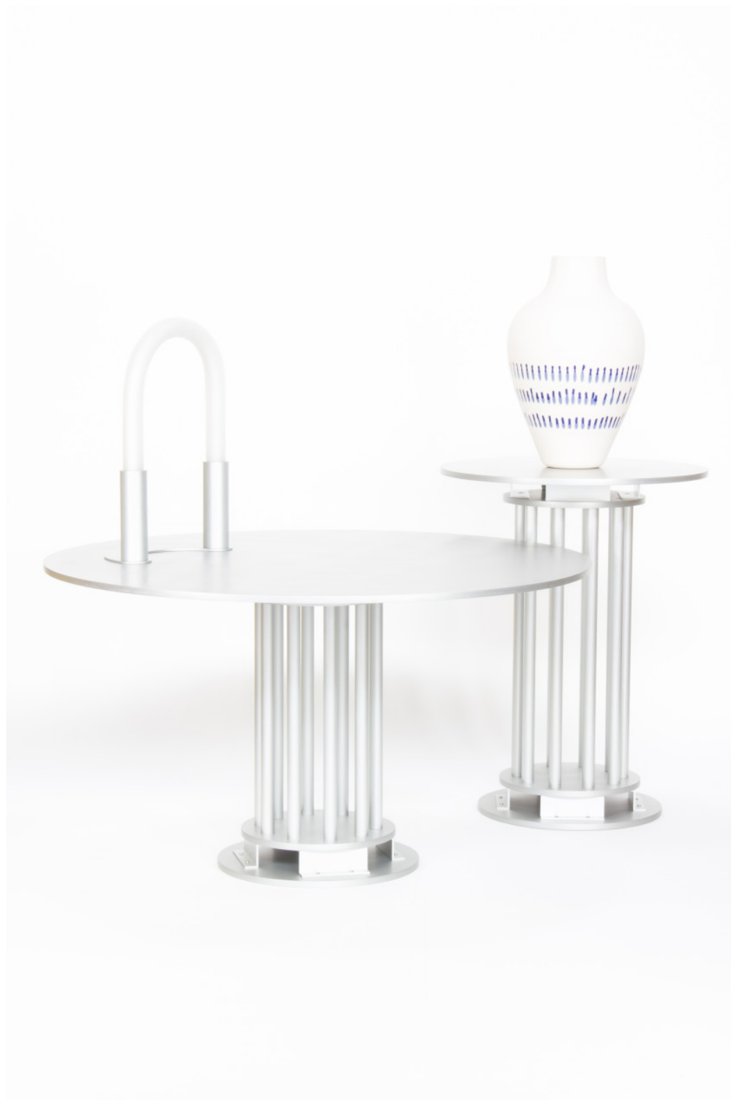
Presentation Paris Design Week 2023