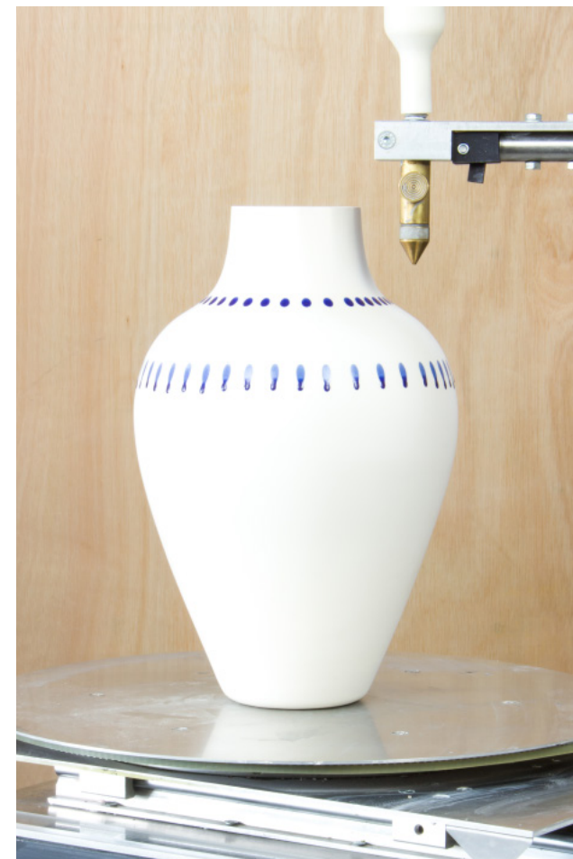
Vase Moca 3/100