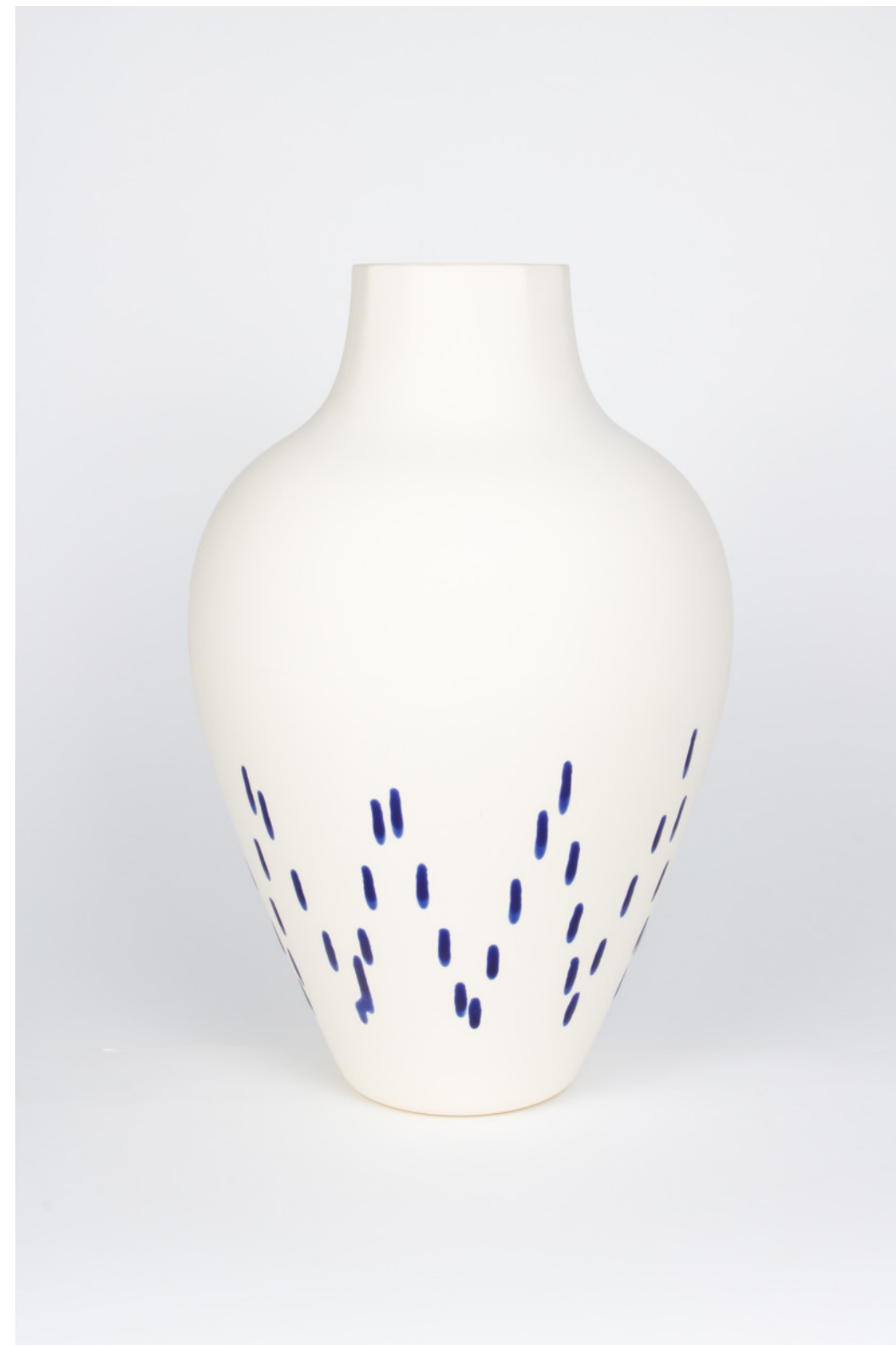
Vase Moca 27/100